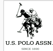
U.S. POLO ASSN. SINCE 1890