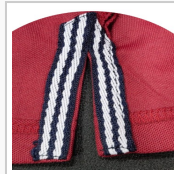
SIDE SLIT IMAGE